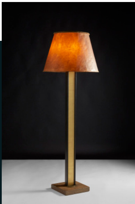
PAUL DUPRÉ-LAFON Rare floor lamp - circa 1950 Estimate : 80 000 - 120 000 €