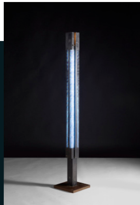
Serge MOUILLE Important column light known as «Grand Signal» - 1962 Estimate : 80 000 - 100 000 €